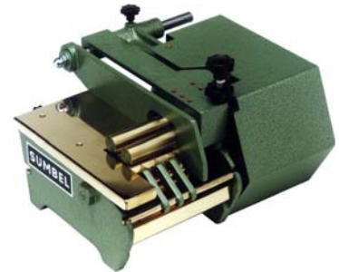
Edge Gluing Machines Mod. PERKEO 60 mm

Options: adjustable speed, stainless steel rollers